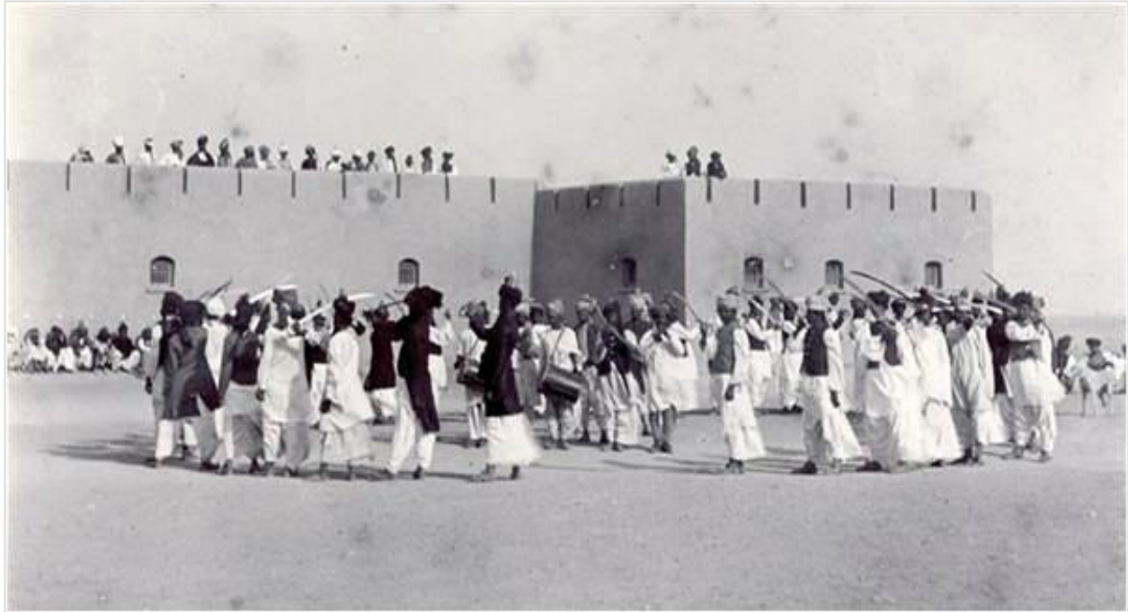
Khattak Attan, 1890 1

The Khattak Attan “is a 5-step routine involving spins, with the swords crossed over their backs and elbows outward, or it can be performed with the swords out to the sides and typically attain half spin in place leading to a full spin”. 33 Depending on the beat’s rhythm, this spin can be completely reversed in full synchronization (clock wise to counter-clock wise). It is performed with the musician adjusting the beat to the technique of the performers. It is executed very quickly, accompanied by the 18-stringed Rubab, Sornai or a wooden flute known as a Toola, as well as double-headed barrel drums (Dohl), which are beaten with sticks. It is a circular dance, ranging from two to over one-hundred participants, allowing performers to go round and round in a circle, as the rhythm and beats fasten. 34 Up to 100 men dance together wielding swords or handkerchiefs, and perform acrobatic feats. The fast tempo of Khattak distinguishes it from other forms of the Attan, which start slowly and pick up speed as the dance progresses.