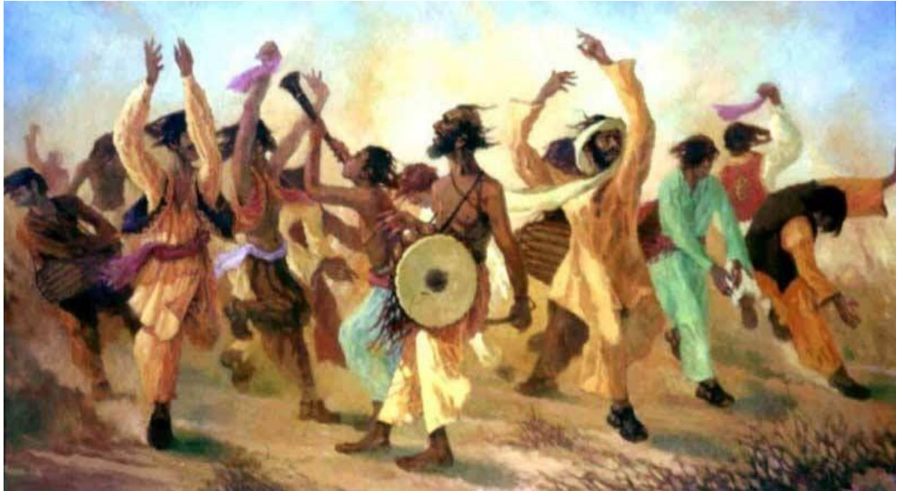
Traditional Attan Painting 1

Sometimes during the Attan there are two circles of dancers, proceeding in an interactional arrangement where one of them sings a song, followed by a response from the other group members, also in the form of a song. 25 Additionally, the Attan can be classified as female performed Attan, male performed Attan or Attan performed jointly, based on the composition of the performers. Attan undertaken by females is a comparatively slow Attan, performed with the accompaniment of a Daria (a local Afghan instrument). Performers spin left in the female Attan, whereas in male Attan, the pace is faster and is accompanied by a Dohl (a drum) and dancers spin to their right. The third variation performed by a mix group of male and female dancers, is slower in motion, with dancers turning towards their right hand. This form of the Attan is rarely practiced in Afghanistan, but was previously very common among young Aryans in the Vedic period. 26