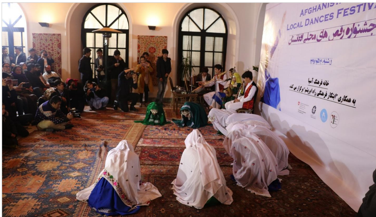
Performance during Afghanistan's Local Dance Festival, Bagh-e- Babur

Ghomborak is another Hazaragi dance that is prone to becoming extinct. Ghomborak (or Ghombor) is linked to nature, as the name of this dance is derived from the sounds a pigeon makes called 'Ghombor' in Hazaragi. Hazara girls and brides (at their wedding party), get together at such occasions and make the sound of pigeons, through their throat while dancing. 49