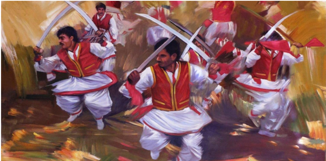
Khattak Dance suit, painted by Mariam Mughal 39

The rhythm is an important element in Khattak dance, with the dancers making a circle formation. They wear special clothing called gand afghani with tight sleeves, as well as a tight woskat (waistcoat). They hit the swords while dancing, and the dancers tighten their girdle ( Kamarband ) such as to make ready for a fight. 40