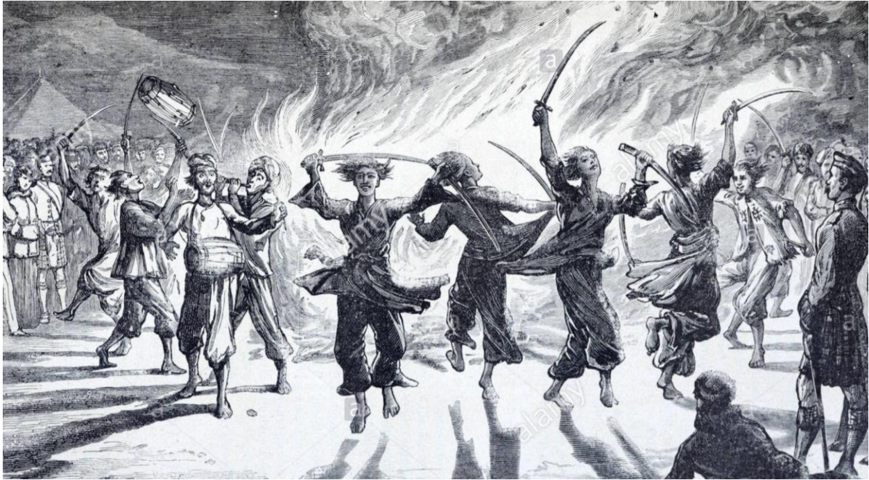
Khattak dance in the camp of the 72nd Highlanders, Kohat, Second Anglo-Afghan War, illustration from the magazine The Graphic, volume XIX, no 475, January 4, 1879. 37

There is an Individual performance of Khattak dance which comprises of twelve steps, requiring great skills on the part of the dancers. The dancer alternates between solo performances and synchronizing with the rest of the troupe. Groups of two or four performers carry a sword and a handkerchief, and perform turn by turn, while the rest of the troupe members wait for their turns.